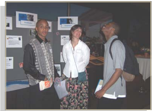
Staff shares information about TCCM programs.