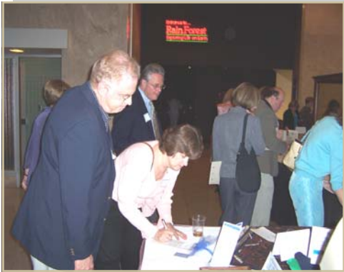
Supporters gather to bid on fabulous items in the silent auction.

Past, present, and future came together during one special evening on June 2 when TCCM held its annual Auction Event. Now in its fourth year, the event theme for 2004, Taking it to the Streets – An Evening of Celebration & Appreciation , set the tone for the evening’s many activities. The past was quite evident as the Milwaukee Public Museum played host to the night’s events, with participants touring the ever-popular Streets of Old Milwaukee, European Village, and Butterfly Exhibits while dining on the museum’s catered pasta and Caribbean cuisine.